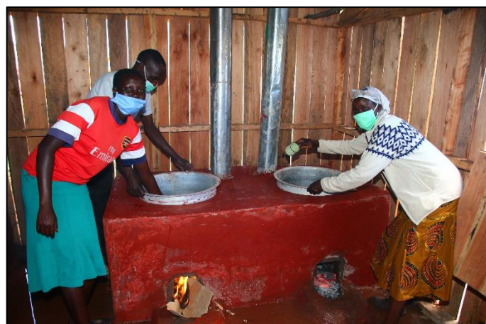
Smokeless stove built in Kutung Primary School

An outbreak of COVID-19 also occurred across three prisons in Kericho. Brighter Communities Worldwide supported the Ministry of Health to contain the outbreak through supplying mattresses and blankets to those affected.