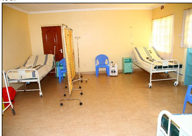
Isolation Ward, Londiani Sub County Hospital