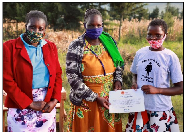
Alternative Rite of Passage Graduation, November 2020

Due to COVID-19 restrictions in place it was not possible to gather all facilitators together in 2020. Brighter Communities Worldwide adjusted the plans, and instead travelled to each ward to meet small groups of facilitators which enabled the planning of Alternative Rite of Passage courses to take place. 80 (39M, 49F) facilitators attended these workshops and discussed the challenges that had emerged due to COVID-19 including the return to harmful traditional practices across the region; increase in teenage pregnancies and early marriages. Together they devised ways of enabling girls to safely attend Alternative Rite of Passage courses in November and December. All facilitators were trained in the Ministry of Health and Ministry of Education guidelines on how to run workshops safely. In total 47 trainings were implemented across the region reaching 793 girls .