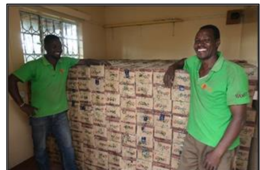
Delivery and distribution of soap and water containers, March 2020