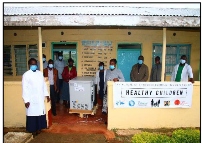
Distribution of vaccine fridge to Laliat Dispensary, September 2020

Brighter Communities Worldwide continued to implement its Maternal, Newborn and Child Health strategy throughout this period. Outreach clinics continued enabling 12,452 beneficiaries to avail of services (Immunisation, maternal health, health talks etc.). In areas where we implemented a tracking system to enable women attend their antenatal check-ups there was a 15% increase in the number of