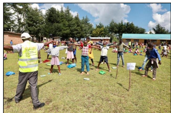
Community Learning Groups, September 2020

There has been an increase in social issues including alcohol and drug abuse and gambling. While school went online for children in many parts of the world this was not possible in Kenya where most homes do not have electricity let alone internet connectivity. There is a real fear of a ‘lost generation’ of children resulting from the pandemic who will be separated from the support and safeguarding structures that education offers as a means out of poverty.