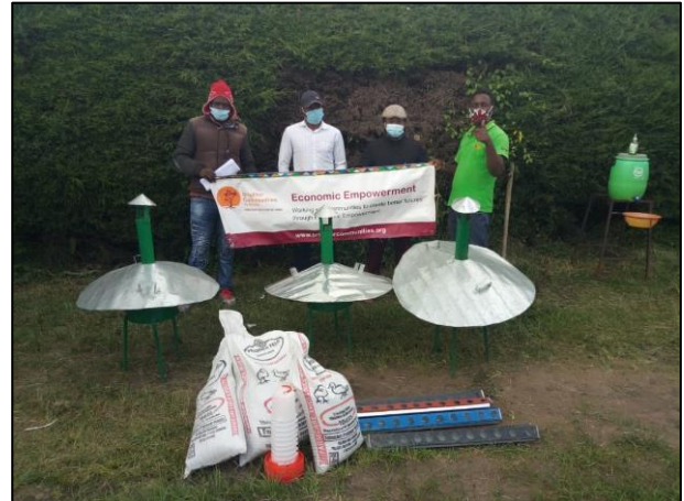
Distribution of materials to Income Generation Group, September 2020

Since March Brighter Communities Worldwide has supported 20 community groups to start income generation projects – some related to COVID-19 such as mask making, while others included tree nurseries, equipment hire, chicken rearing, coffee planting, and bee keeping. Households across Kericho have seen a large reduction in their income since March. Projects like these will contribute to alleviating some of this reduction over time. Each group supported was also given capacity development by BCW and this will continue over the coming months. There are 423 (165M, 258F) members in these groups of which 50% are young people, and 3 projects are supporting people with disabilities.