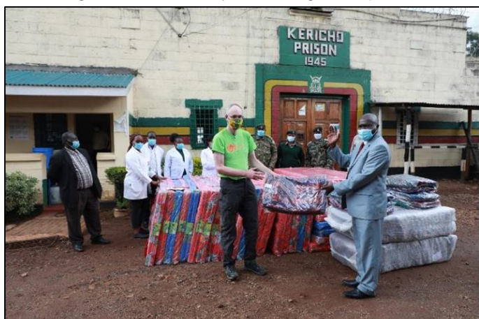
Distribution of resources to Kericho Prison

Once the families relocated back home the stove and kitchen were used to cook for the children attending the Community Learning Groups.