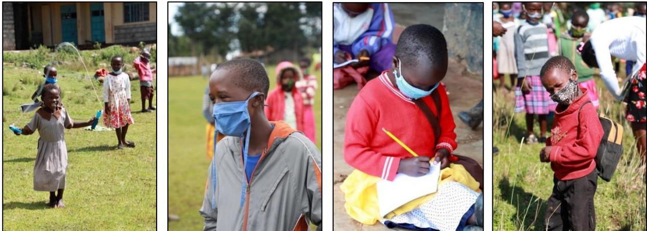
Community Learning Groups, Kutung, September 2020

Young people were also adversely impacted by COVID-19. Our focus is on sensitizing them to become COVID-19 Ambassadors in their community and also on supporting their income generation projects. This includes working with “boda boda” drivers (motor bike taxis) and youth groups across the region. Since March, we have sensitised 900 Boda boda drivers across 122 stages in two sub counties. This involved sensitising the drivers on the signs and symptoms of COVID-19, how to protect themselves; providing masks and hi-vis vests with key messages to the drivers. At each stage handwashing facilities and soap were provided and all drivers were encouraged to ensure that their passengers took the necessary COVID-19 precautions before boarding the bike.