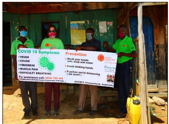
Centre Ju - Town Centre Distribution, May 2020

In summary we supported the sensitisation of communities on COVID-19 across Kericho County; we have strengthened health facilities through capacity development of health care workers and the provision of essential supplies (PPE, handwashing facilities, and communication materials); we have supported vulnerable children who are out of school and girls and women who are particularly impacted by this pandemic. We have supported the Ministry of Health as they continue delivery of essential services through the provision of Outreach Clinics and Ante-natal tracking across the region.