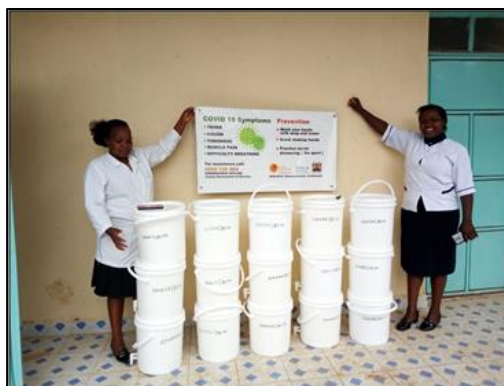
Health Clinic staff receiving buckets, soap and posters for handwashing stations, March 2020