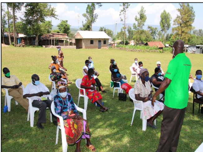
Training of Community Health Volunteers, Koru, May 2020

COVID-19 has not eliminated the need for our community development programmes. In many ways it has created a greater and more urgent need – we've had to find ways to 'pivot' or switch how we can deliver them so that they can continue while still observing restrictions that kept the community and our team safe from transmission of the virus. Our mission remains as it always has been - working in partnership to delivery programmes that enrich lives and help create better futures.