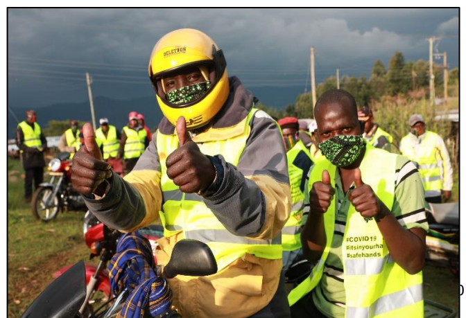
Boda Boda Sensitisation, Ndubusat, September 2020