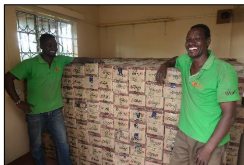
Our logistics team with soap deliveries - March 2020

Between March and December 2020 a total of 464,244 beneficiaries were reached through our response. This includes 128,094 men, 140,868 women, 93,246 boys and 104,368 girls. We would like to express our deep gratitude to our donors, staff, volunteers and supporters who made our response possible. Asante Sana!