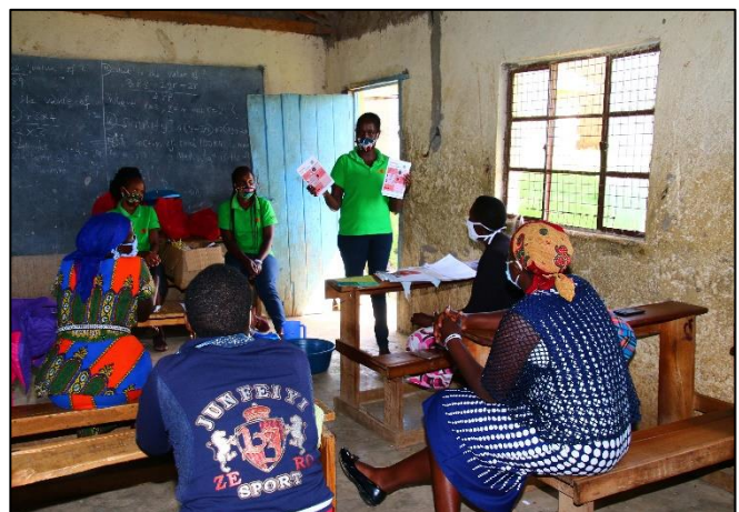
Various Menstrual Health Ambassadors Trainings