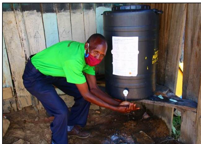
Handwashing Sensitisation, May 2020