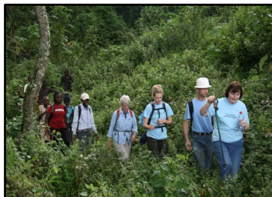
Volunteers from the Harambee team in November on the trekking route

FOL began working on a sustainable tourism project in 2010 in response to requests from the leaders of local communities for economic development. In discussions with these leaders, a clear link emerged between the approach of developing Healthy Villages, and a community lead model of tourism. The goal of this project is to develop a community-based sustainable tourism project that provides employment and financial benefit to the local communities; that in turn raises the standard of living; encourages gender and social equality; and biodiversity conservation. Several pilot treks were held throughout 2013 in the area of the sustainable tourism project. The purpose of the trek included enabling participating villages to be familiar with the entire trekking route and learn about the features of each community and to encourage interaction between villages and within villages and to gain an insight into what visitors like and want so preparations can be made. FOL has partnered with the Irish Foundation for Cooperative Development for development of the pilot trek in 2014.