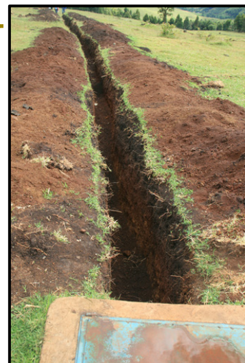
Ground preparation for pipework at the Kimologit Gravity Water Project

This gravity water fed scheme continues to grow and develop each year and in 2013, the Ndubusat Water Committee extended the project by four kilometres. A number of water meters were put in place to allow the committee to manage charging for the water more efficiently. FOL continue to support the management committee of this scheme through capacity development and technical advice.