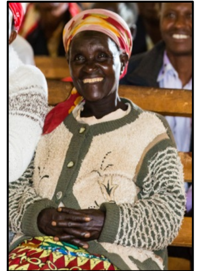
Community member at the strategic planning workshop

In May 2013 the new strategic plan was launched. A new 'tag line' "Creating Better Futures" was adopted. FOL is an organisation built on integrity, passion and good governance, with a track record of success. Looking ahead to the future, FOL together with its partners aims to create a sustainable future for the next generation. FOL will be advocates for people who don't have a voice. FOL will continue to work in partnership with local people, officials, NGOs and the Kenyan Government. FOL will give people the tools to build on what they already have, and will take the traditional way of doing things to improve lives for everyone. FOL and its partners will work together to change the economic future for good.