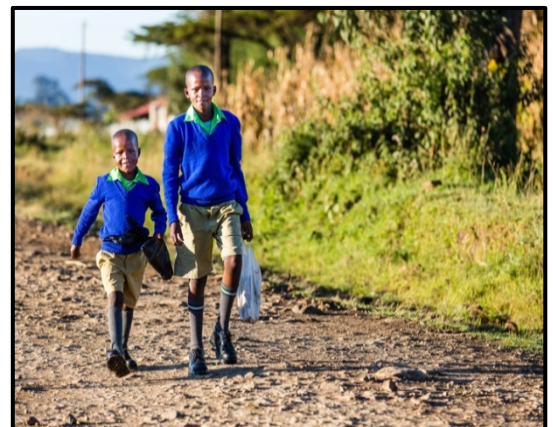
Heading to School in Londiani

The Healthy Schools Programme takes its lead from the WHO Healthy Environment for Children's Alliance (HECA) and aims to create a healthy environment for children at school by working with the children to identify areas that need improvement and work with them to make those improvements. In 2013, 30 new schools were identified to be added to the HSP. This brings to 107 the total number of schools in the programme. There were construction projects in six HECA schools, resulting in three latrine blocks for boys; five latrine blocks for girls; four washroom blocks for girls; one washroom block for boys; two latrine blocks for preschools; nine water tanks and two ferrocement tanks.