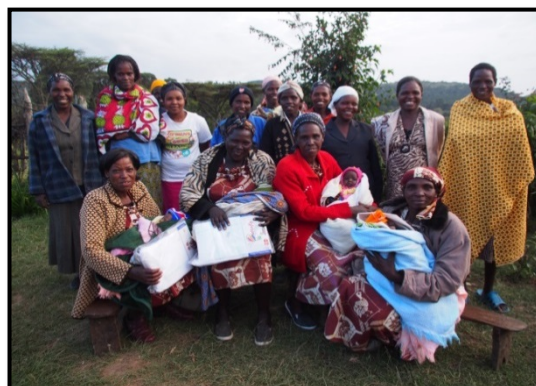
Women from the Maternal Health Task Force with their babies in Londiani