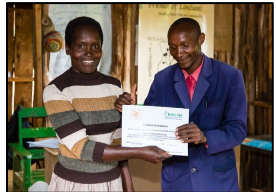
Local man receiving his Lifeskills Certificate on completion of the Lifeskills Peer Education training

FOL have run peer-led Lifeskills courses since 2002. Participants follow a programme including modules on relationships, sexuality, HIV/AIDS, maternal health, caring for the sick, communications and stages of development. It is often the first point of contact between FOL and the community. In 2013 10 courses were conducted reaching 467 participants. In November the Life skills course was reviewed when 25 Trainers from across the District came together to evaluate the impact of the Life-skills Programme, and look to the future of the programme. These changes will be implemented in 2014.