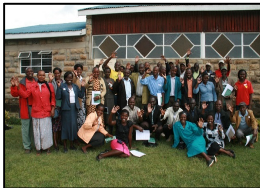
Community members at the FOL Annual Partnership seminar