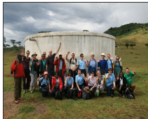
Volunteers on Harambee project at the Kimologit Water tank in November

This project is a joint project with the District Water Office (DWO) and the community of Kimologit. In 2013 the intake and a 100 cubic metre storage tank were built. Six km of pipes from the remote intake to the storage tank were put in place.