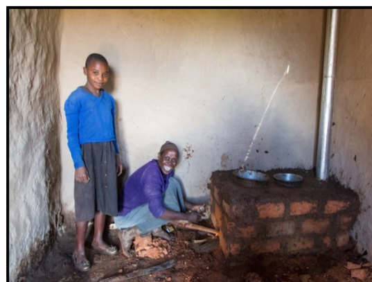
Mother and daughter during installation of a smokeless stove at their home.