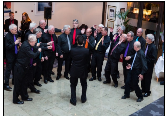
Members of the Polyphonics barber shop singers performing at the Gathering in April.