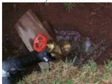
The water flows in Ndubusat