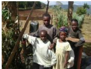
At the water tap in Ndubusat